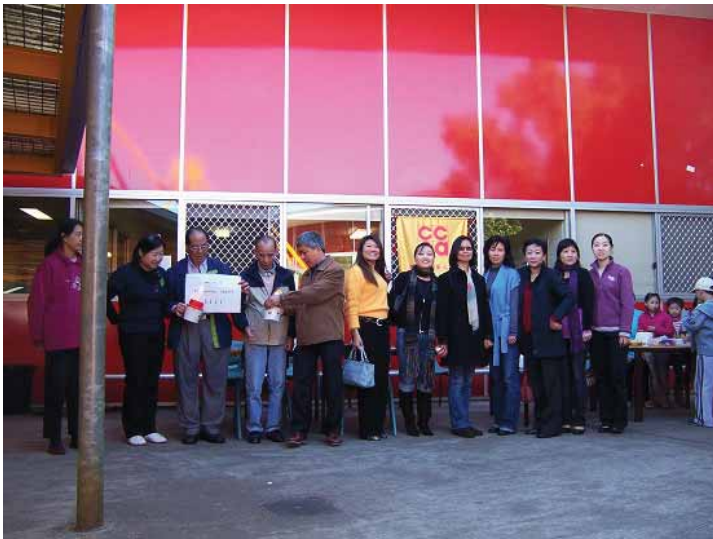
Our staff joined CCCA Senior Group in raising fund for Australian Red Cross's China Sichuan Earthquake Relief